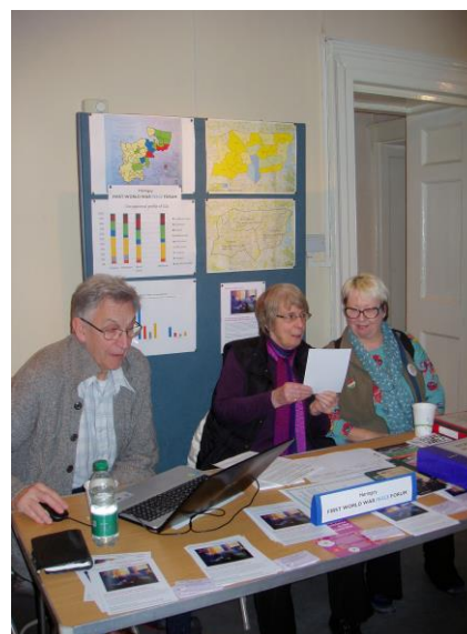
at Bruce Castle history fair